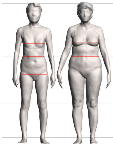
Comparison of body size between average female in China and U.S.